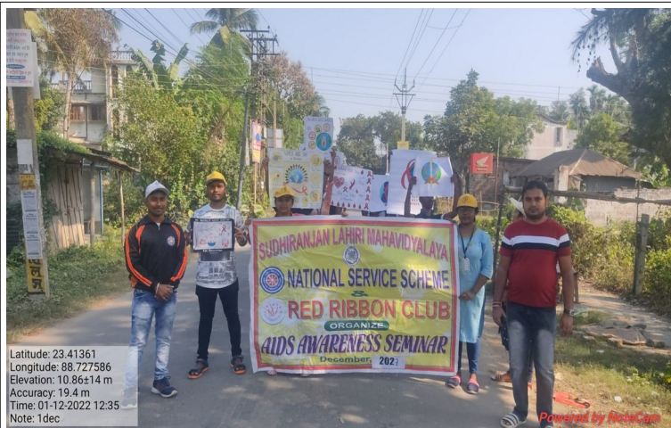
Latitude: 23.41361 Longitude: 88.727586 Elevation: 10.86±14 m Accuracy: 19.4 m Time: 01-12-2022 12:35 Note: 1dec