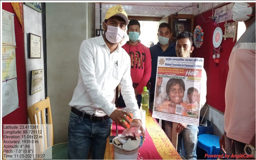
Latitude: 23.415381 Longitude: 88.729112 Elevation: 15.08±22 m Accuracy: 1939.0 m Azimuth: 4° (N) Pitch: -7.0° (0.8°) Time: 11-25-2021 13:27