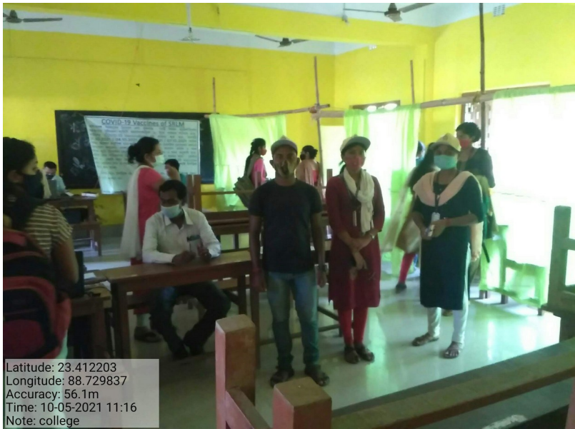
Latitude: 23.412203 Longitude: 88.729837 Accuracy: 56.1m Time: 10-05-2021 11:16 Note: college