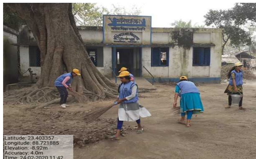
Swachhta Programme at Kuthipara Primary School