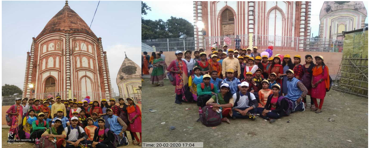
Shibnibas Fair Visit