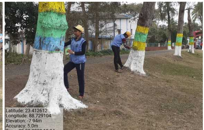
Beautification Drive at College Campus