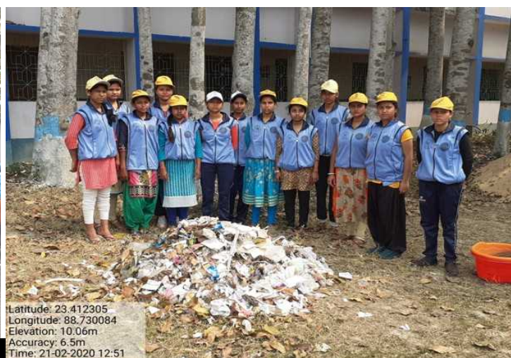
Swachhta Programme in the College campus