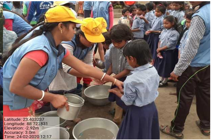
Hand Wash training and hand wash drive in at Kuthipara Primary School