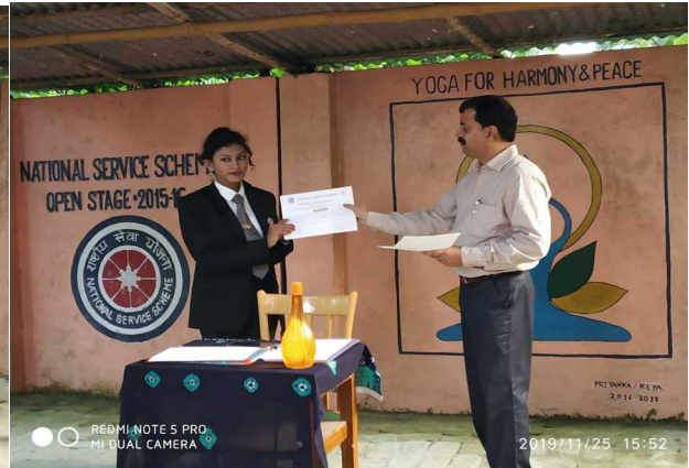
Certification of the Volunteers completed NSS in 2018-19