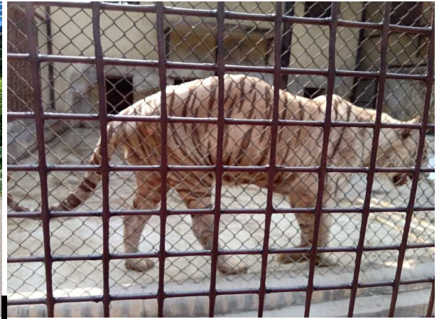
Visit to National Zoo