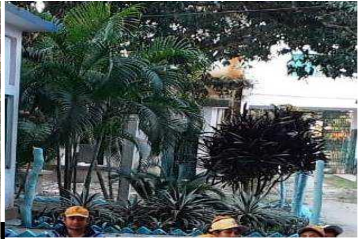
Fencing Foliage Garden