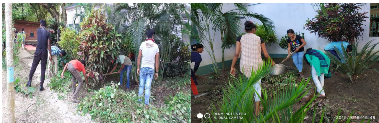
Nurturing of Herbal Plant/ Nurturing of Foliage & Cactus Garden