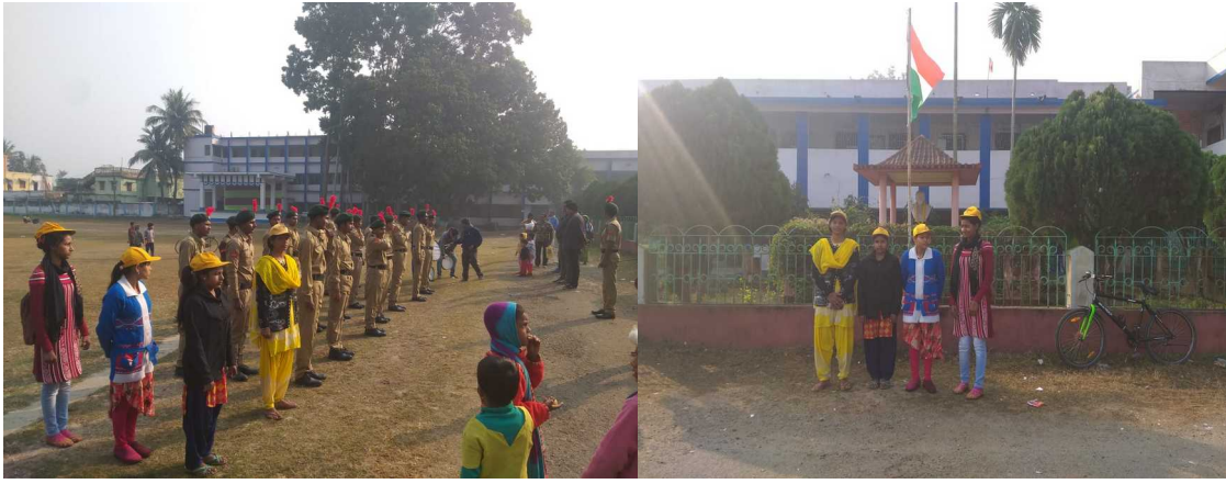
26 th January Flag Hoisting