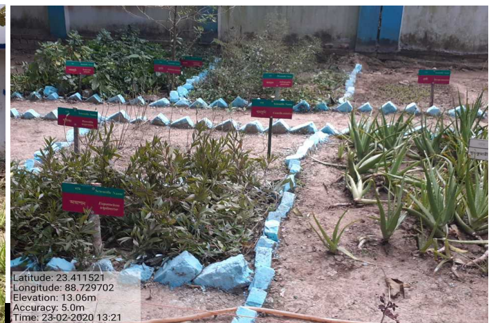
Reorienting Herbal Garden