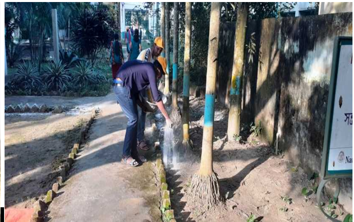
Campus Cleaning & Bleaching Spreading