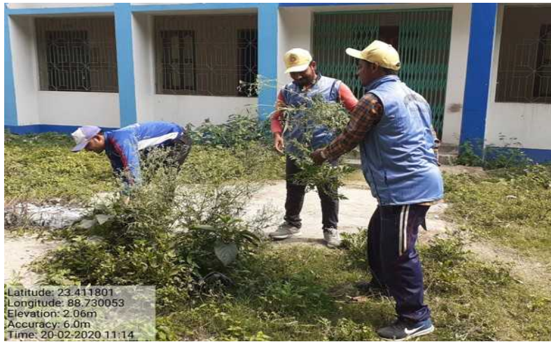
Destroying parthenium plant in the College campus