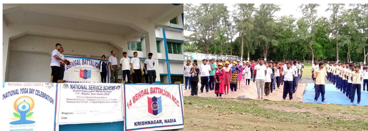
International Yoga Day celebration